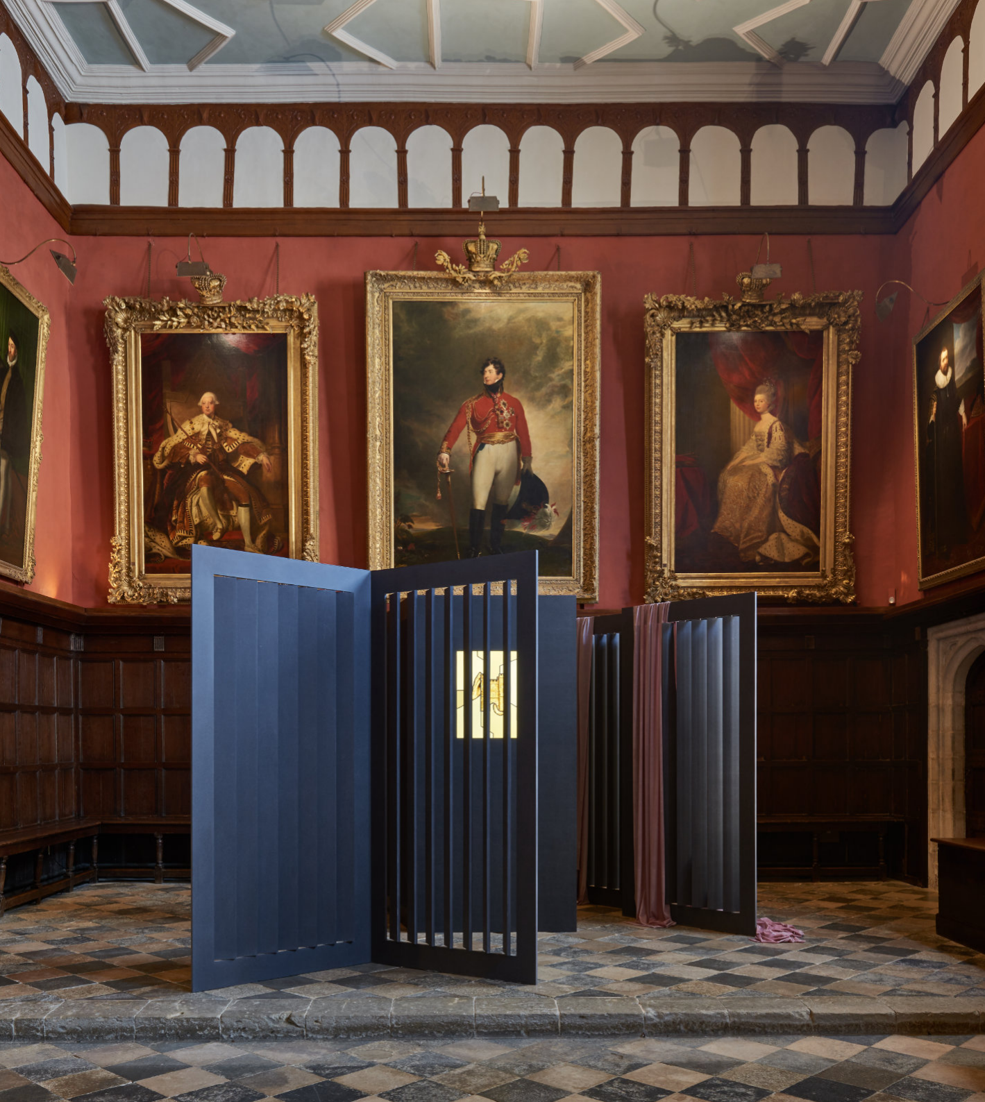
Previous page: Stained glass design, featuring a wooden model of Knole House held in the hands of the female relations of Vita Sackville-West. Left: Installation in Knole Great Hall.